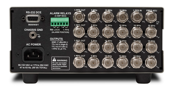
FS725 rear panel (with Opt. 03)

O725RMD Double rack mount kit O725RMS Single rack mount kit